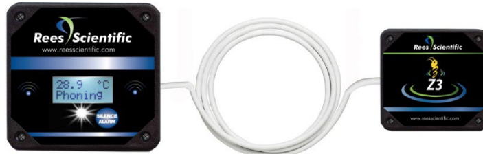
Expansion Modules with LCD and Z3 Wireless