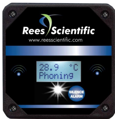
LCD display with alert and inhibit alarm button