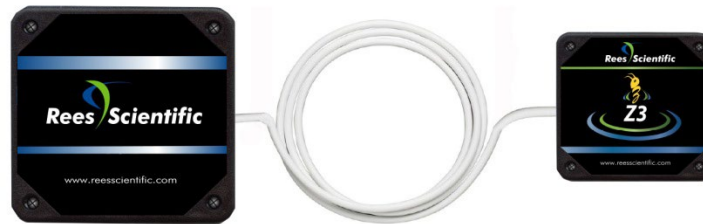
Expansion Modules with Output Relay and Z3 Wireless