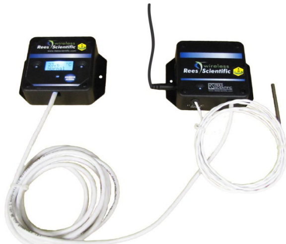
LCD expansion modules

View sensor conditions of your unit right from the LCD display module. Many module families support the LCD displays. The displays can support one or two sensors and they can come equipped with a local audio and visual alert that can be silenced from the module with a push of a button. NOTE: the alert is designed to remind the user to close the refrigerator door. It is NOT documented and silencing it does NOT inhibit the Centron system alarm. If the out-of-range condition persists, a documented Centron system alarm will occur along with all of the usual alarm and dial-out options. This is done this way because a silence button provides no indication of who pressed it and inhibiting a real alarm with such a button would be a violation of GxP and any other quality assurance based accountability requirement.